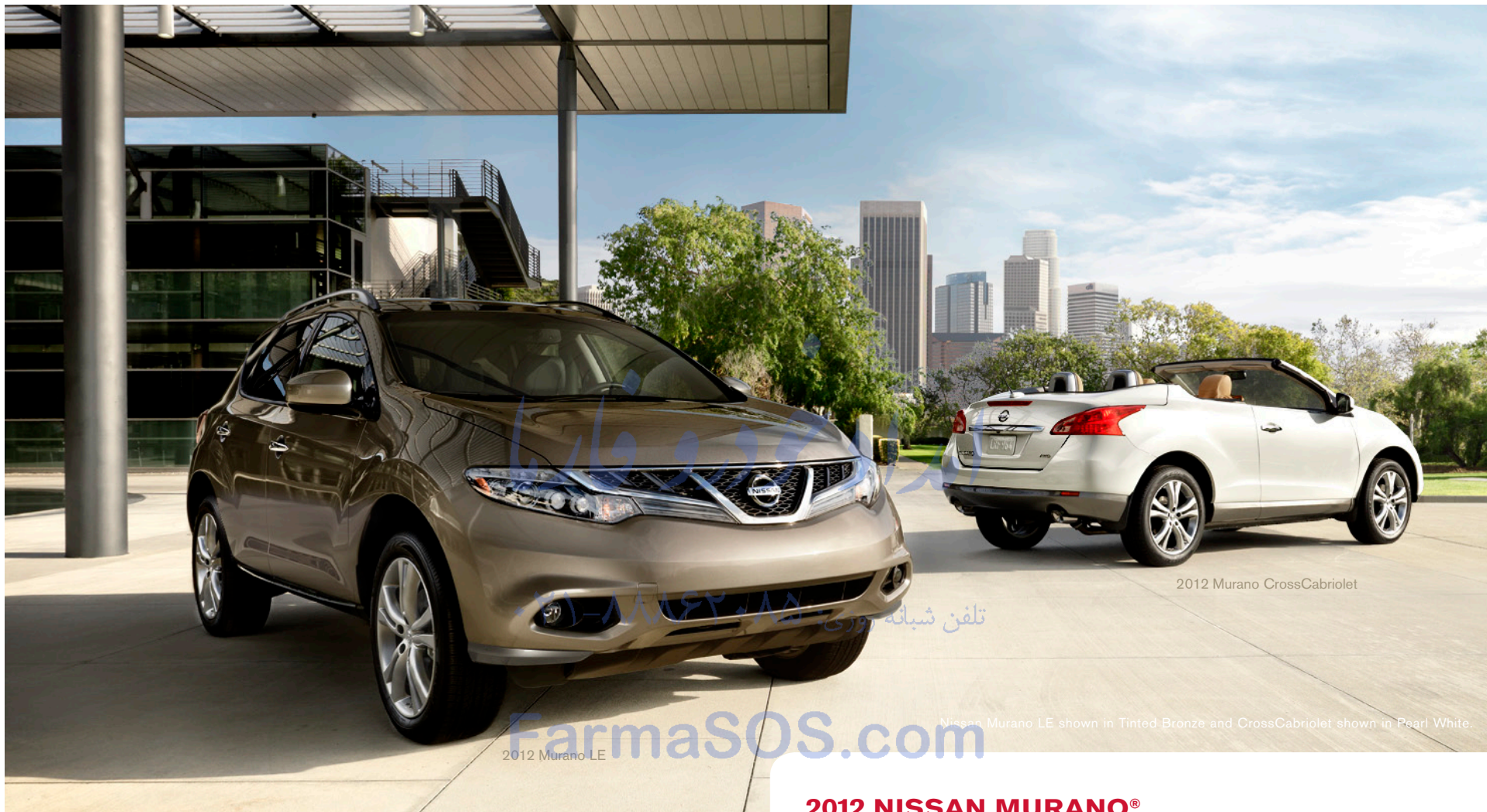
2012 Murano CrossCabriolet