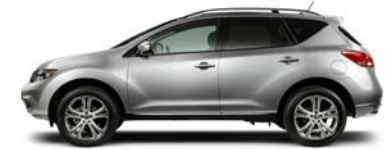
LE: PORTRAIT OF LUXURY