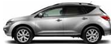
SV: PICTURE OF VERSATILITY