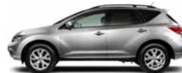
SL: STATEMENT OF BEAUTY