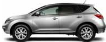
S: REDEFINITION OF ADVENTURE