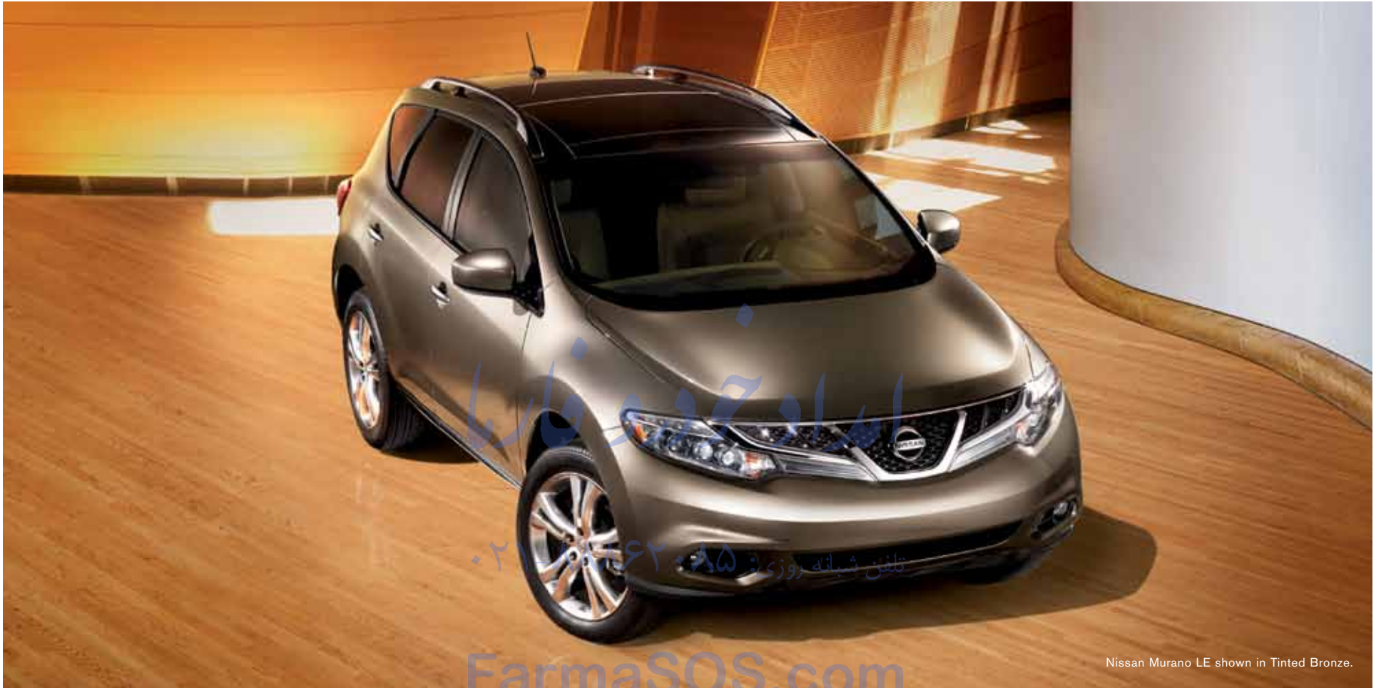
Nissan Murano LE shown in Tinted Bronze.