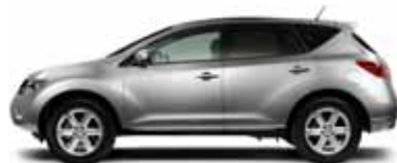
S: REDEFINITION OF ADVENTURE