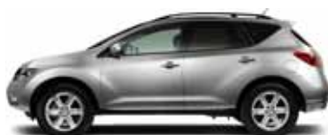
SL: STATEMENT OF BEAUTY