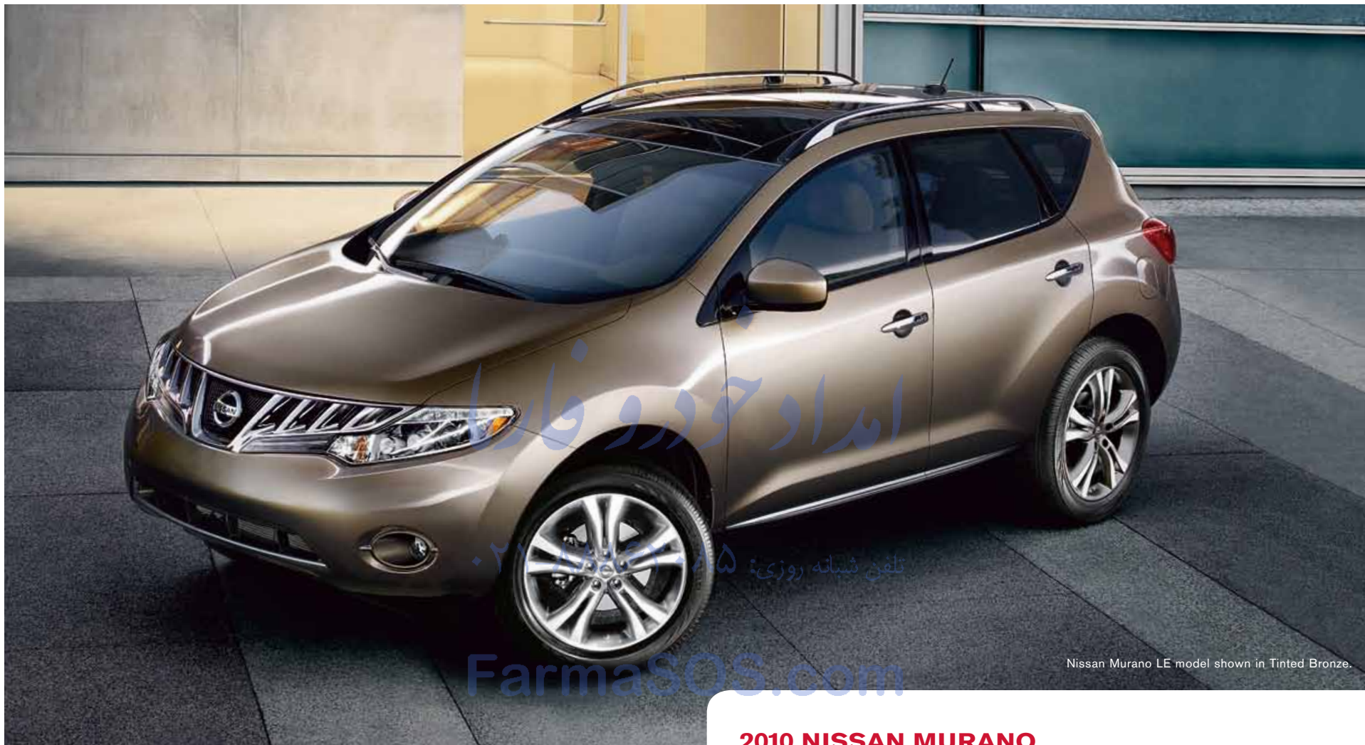
Nissan Murano LE model shown in Tinted Bronze.