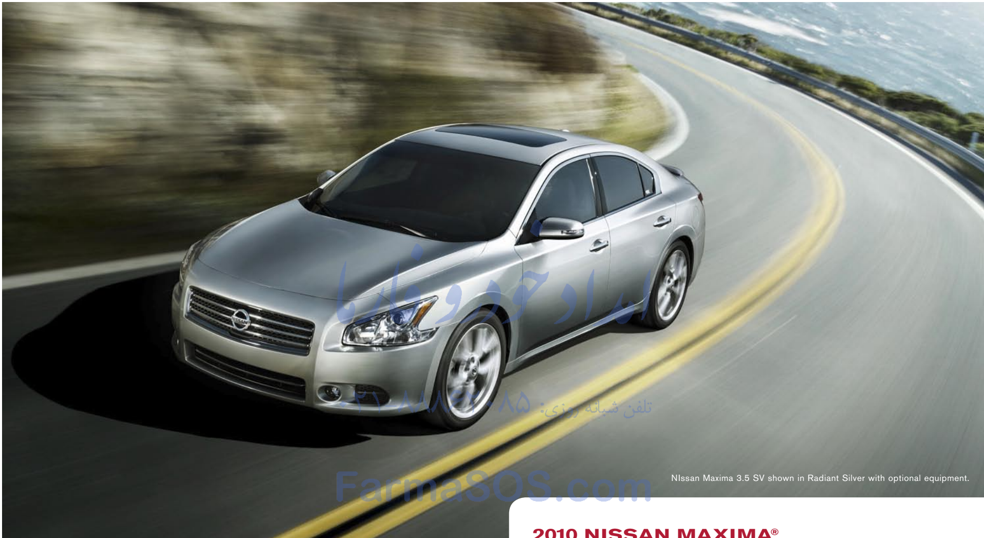
Nissan Maxima 3.5 SV shown in Radiant Silver with optional equipment.