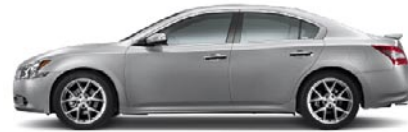
3.5 SV: WITH SPORT PACKAGE